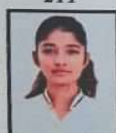
KIRTI (OBC) 140